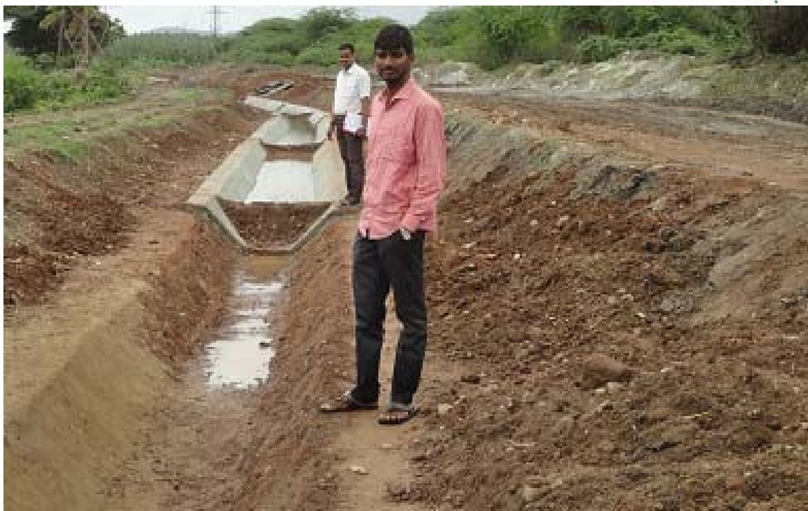
Photo 5: PSC Staff at the construction site to inspect the Silt Disposal Practices of the Contractor – Photograph taken on June 28, 2016