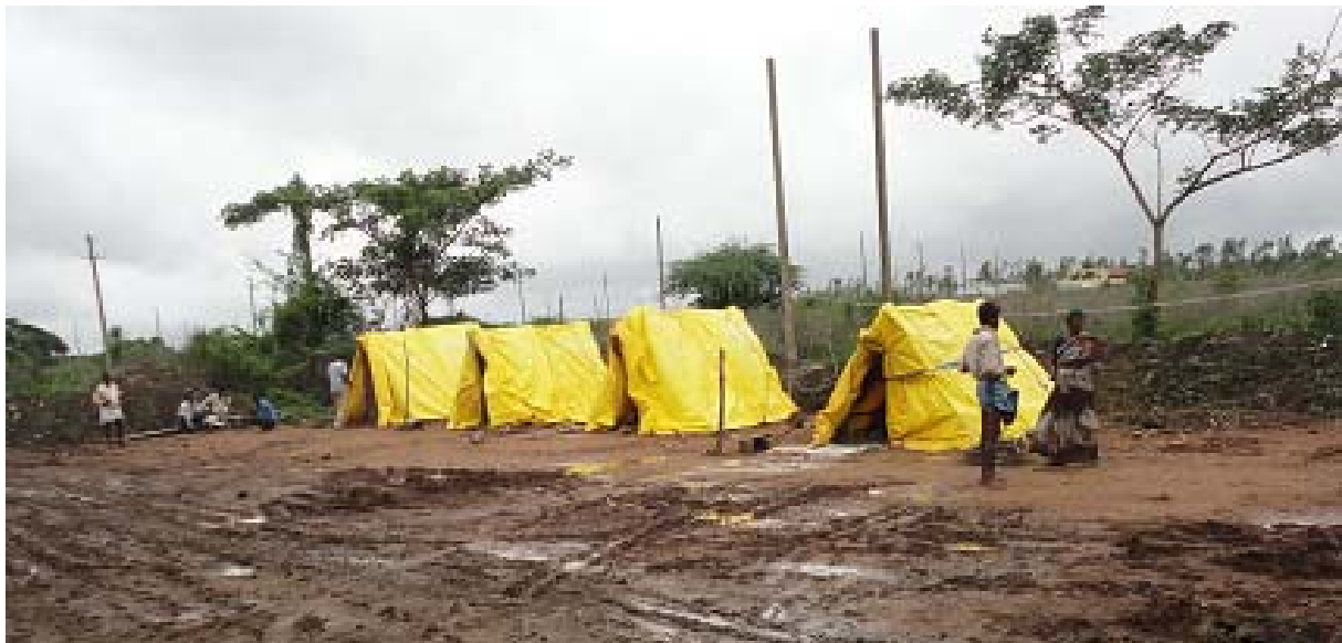
Photo 4: Temporary Shelters provided by the Contractor for labourers to utilise during either a break or temporary halt in construction triggered by natural events – Photographs taken on June 28, 2016