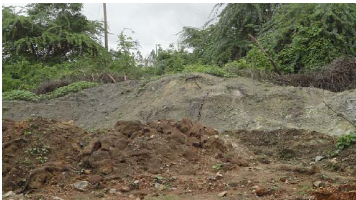
Photo 6: Close-up View of the Disposal of Silt as currently practised by the Contractor – Photograph taken on June 28, 2016