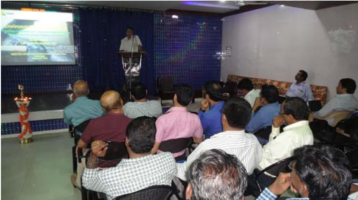
Photo 1: Environmental and Social Safeguard Issues being covered by the PSC at the Construction Management and Quality Control Workshop held at Shivamogga on February 27, 2016