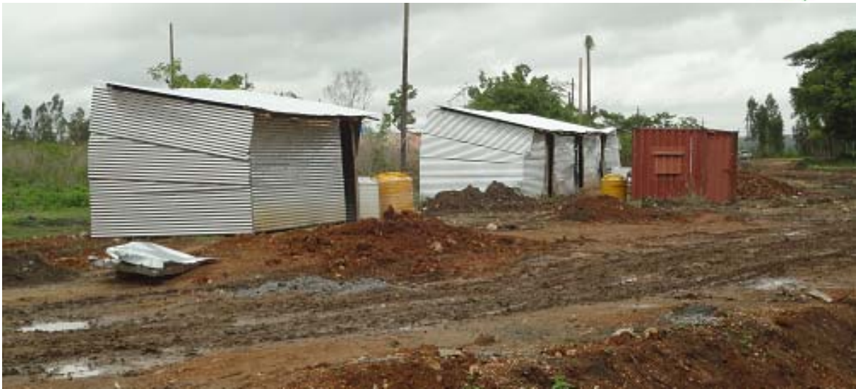
Photo 3: Make-shift Labourer's Quarters provided by the Contractor with Water and Sanitation Facilities