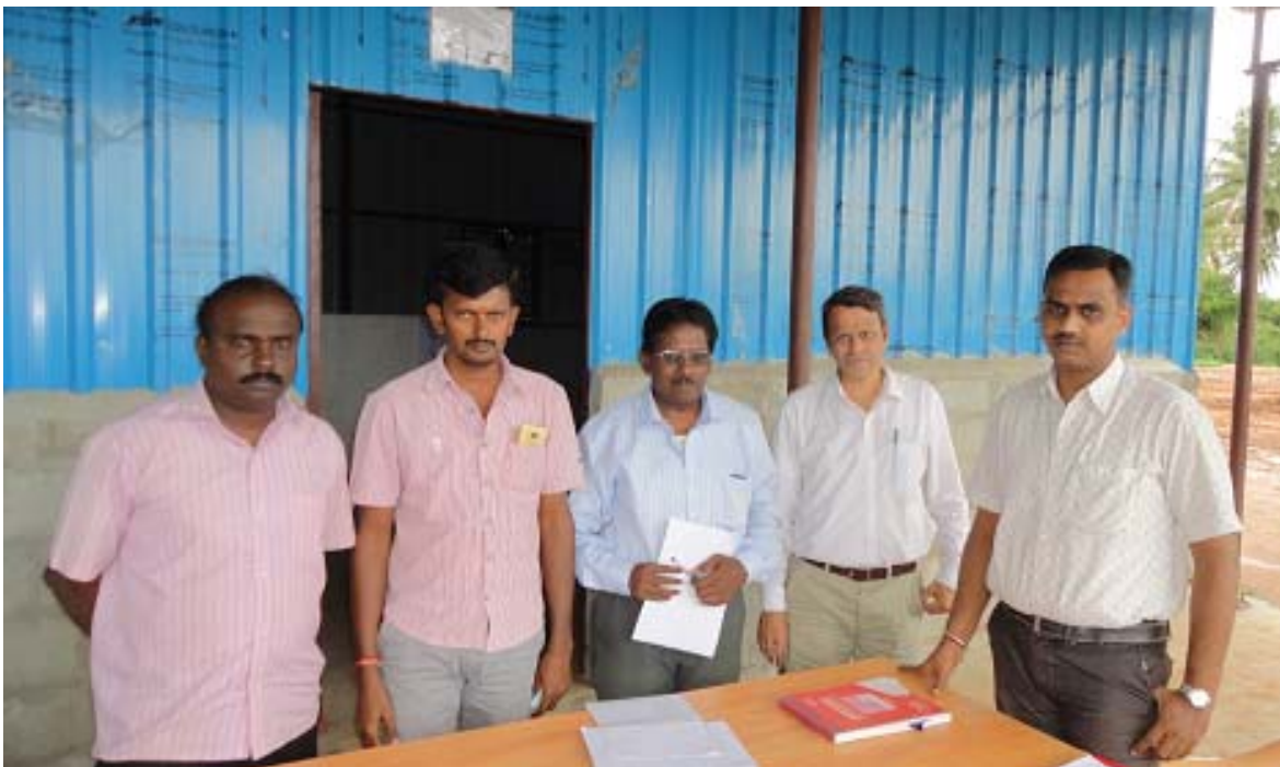
Photo 2: Meeting of the PSC with the RPP's Officials on June 28, 2016. At this meeting, the PSC explained the various safeguard issues with the Contractor